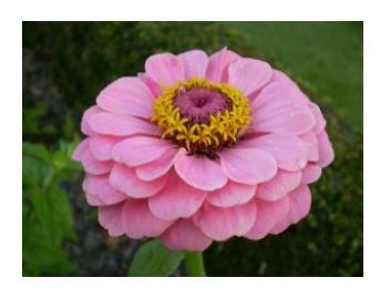
Zinnia elegans

Heat tolerance is also a characteristic to look for when planting in the spring in a climate such as Alabama's. This quality can be found in flowers such as Rudbeckia hirta, commonly known as black-eyed susans, and Salvia farinacea. Salvia farinacea can behave as a perennial in the southern most parts of Alabama.