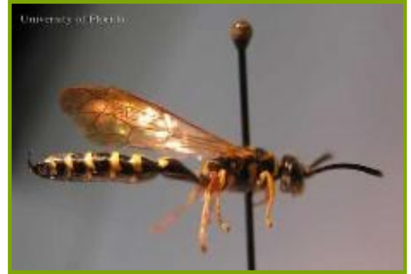
Picture presented on the University of Florida IFAS Extension website.

You can learn more about this insect by following this link: http://edis.ifas.ufl.edu/in857