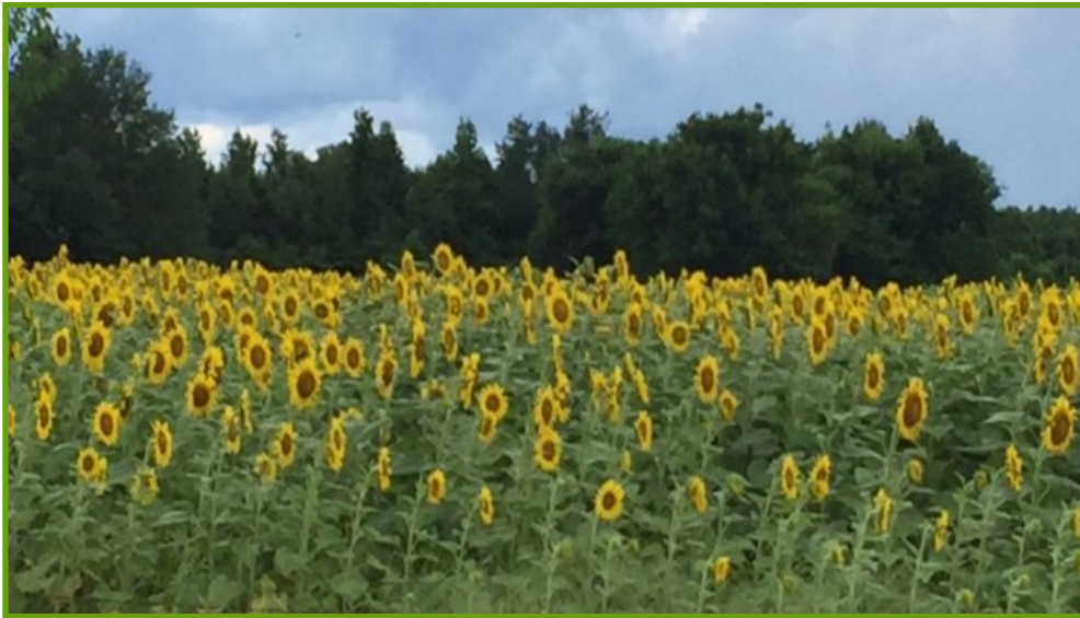
Above: Sunflowers growing in a field off Highway 14 between Autaugaville and Selma.

Every year, commuters on Highway 14 between Prattville and Selma are treated to the beautiful vision of rows and rows of Sunflowers.