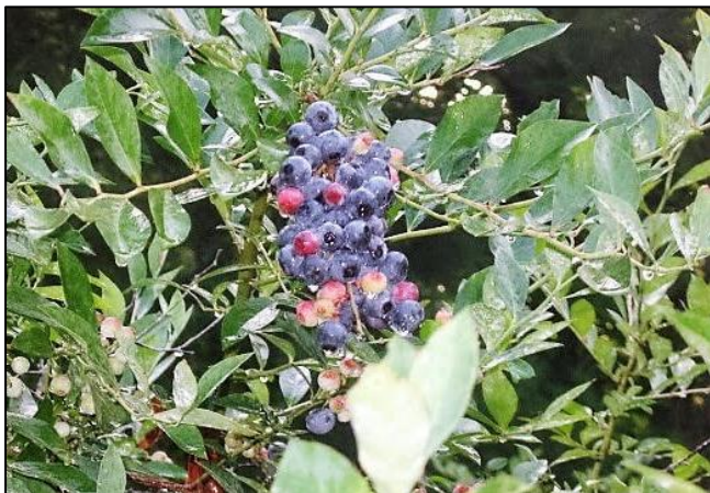
Blueberries getting ripe

I could go on and on about my favorite plant, but space will not allow it, so let me urge you to try a few blueberry bushes (more than one variety is highly recommended for pollination purposes) either in a neat row or scattered around the yard as ornamentals. Either way, you'll be glad you did."