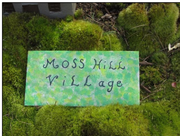
Moss Hill Village