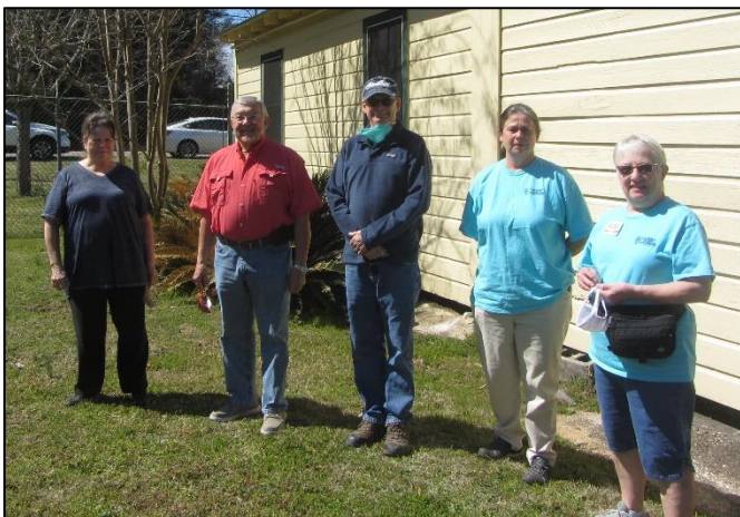
Bronze star recipients