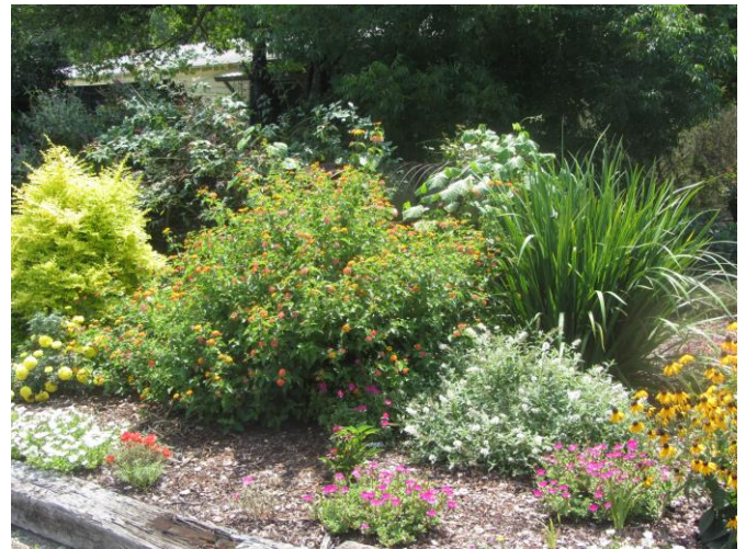
Entrance to Cane Creek Community Gardens