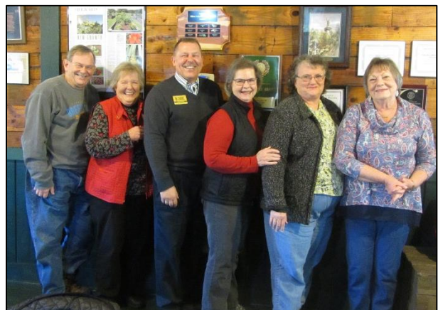
2020 MG Board of Directors

Friday 2/21, 3-6:30pm, on The Square in Jacksonville