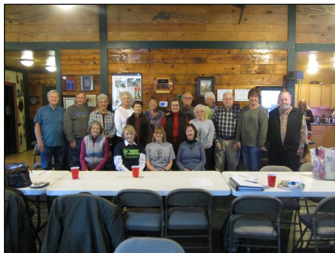
Our over-70 MG gardeners just keep on gardening!