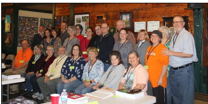
Master Gardener Intern class of 2020