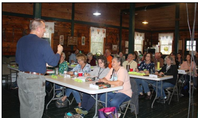
Skeeter gets a laugh at the first day of the intern class