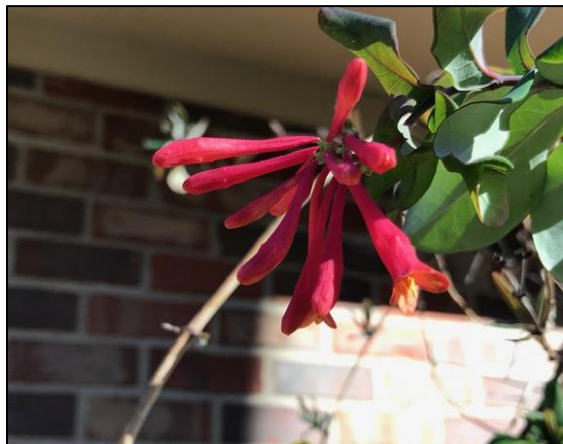
Coral honeysuckle, Lonicera sempervirens