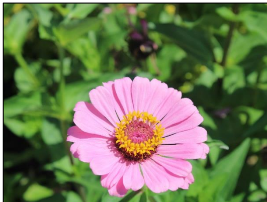
A beauty from CCCG Butterfly Garden