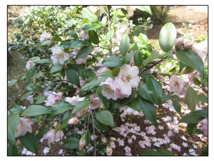
'Tiny Princess' Camellia

An invasive tree is taking over many vacant areas. It is a good time to ID and apply control to invasive Callery Pear seedlings. https://www.uaex.edu/publications/pdf/FSA-6124.pdf