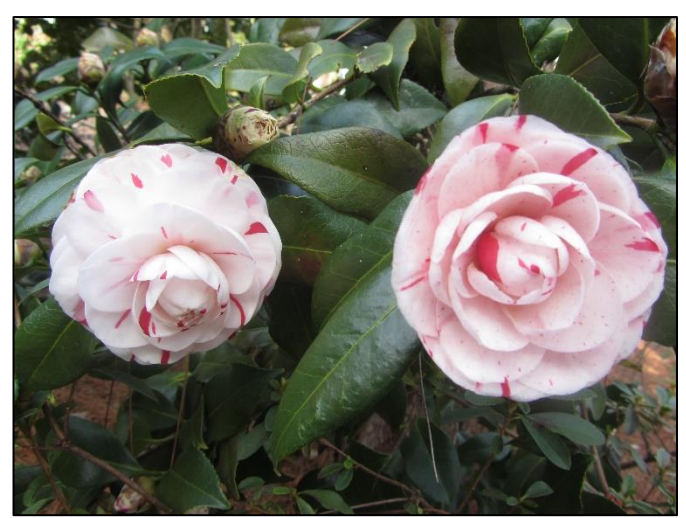
Camellia Japonica 'La Peppermint'