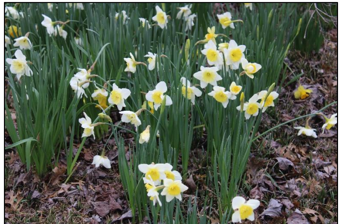
Cane Creek daffodils