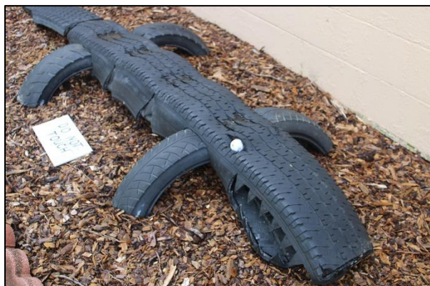
New inhabitant at the 4H wildlife room, created by Billy McDaniel