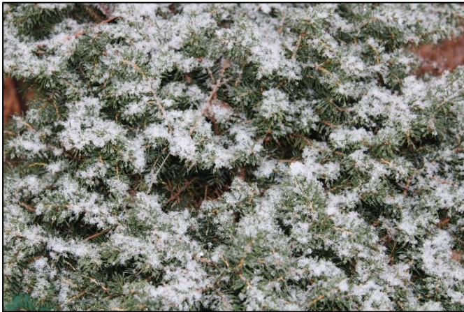
Japanese Maple frosted with snow