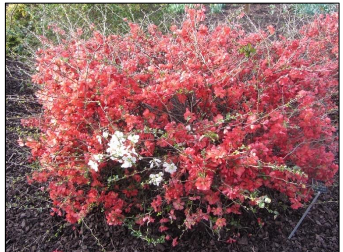
Winter bloomer: ornamental quince