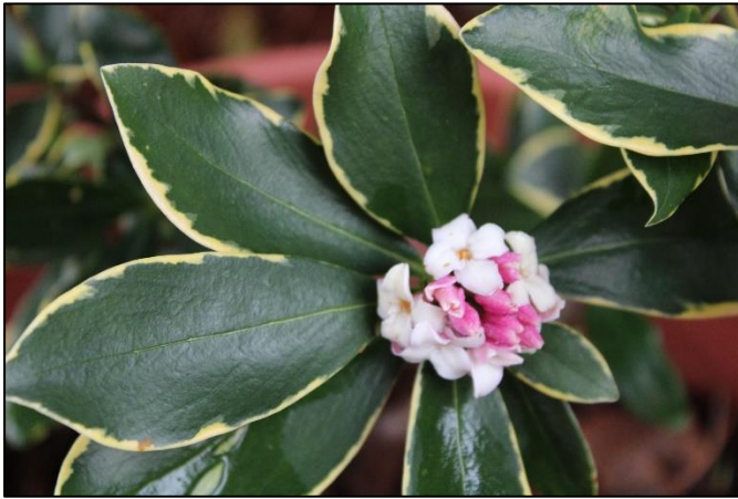
Winter bloomer: daphne odora