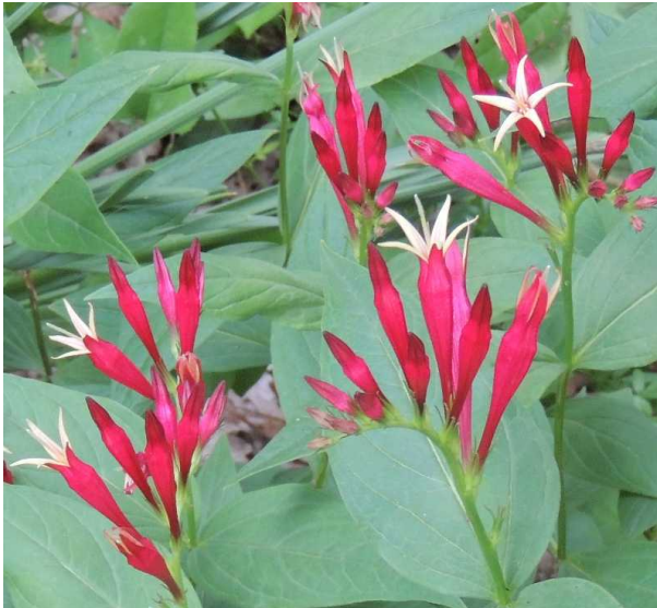
Indian Pink