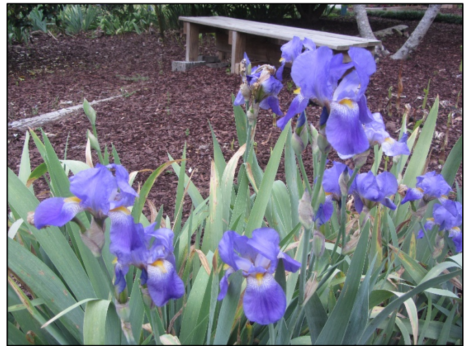
Iris at Cane Creek