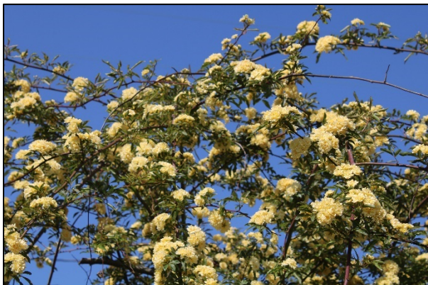
Lady Banks Rose