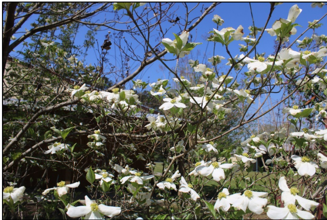
Spring arrives at Cane Creek