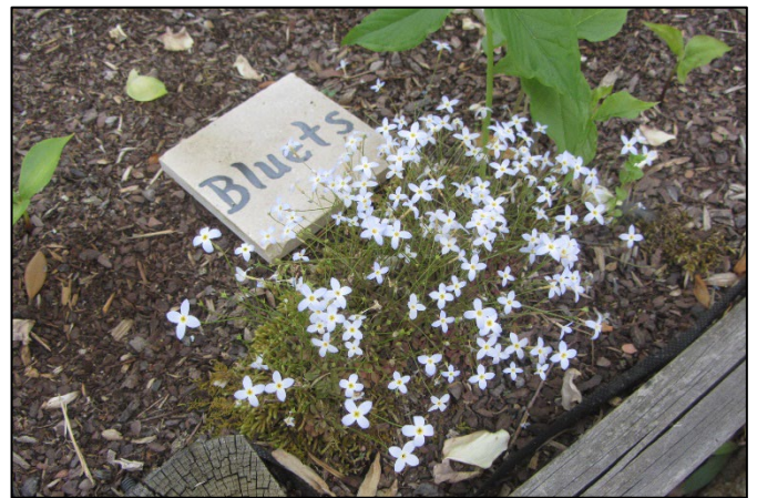
Natives blooming in the Sweet Tea Garden