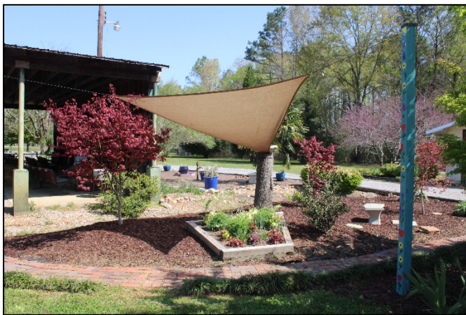
Cane Creek sail cloth garden