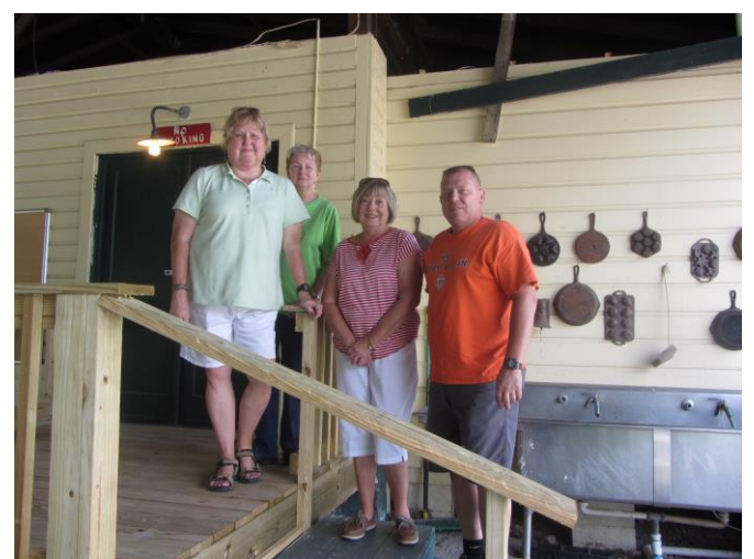
Another view of the ramp