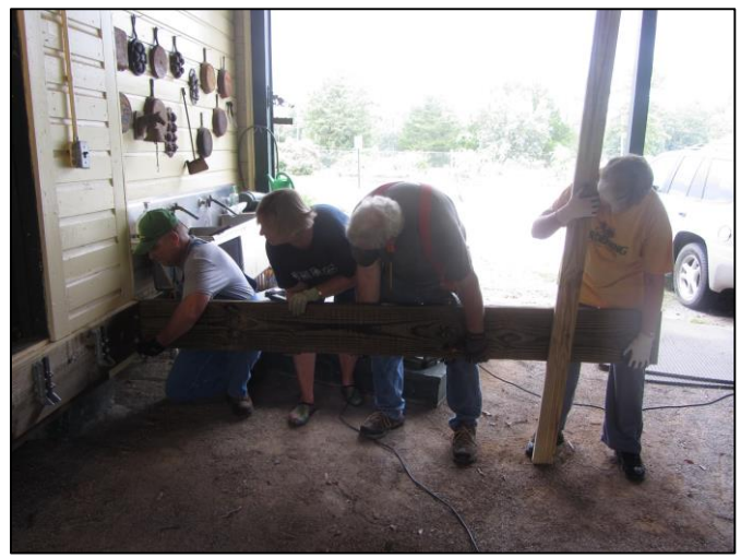
Putting together the Cane Creek wheelchair ramp