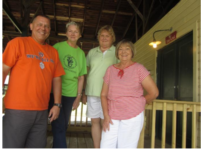
Finished ramp—all smiles!