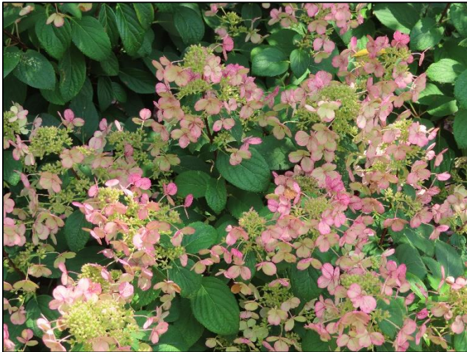
Hydrangea in the CC Serenity Garden