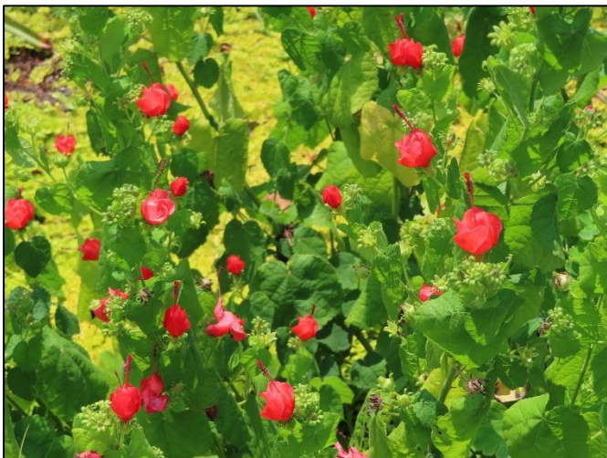
Turk's Cap Hibiscus at CC Serenity Garden