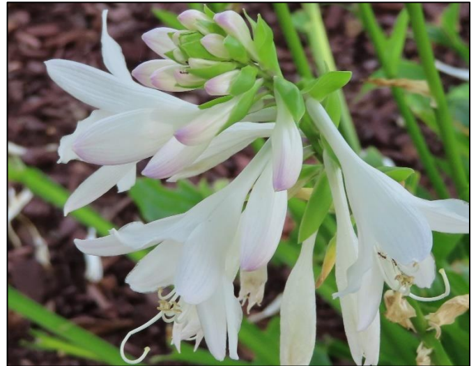
Hosta in bloom in CC GOAT Garden