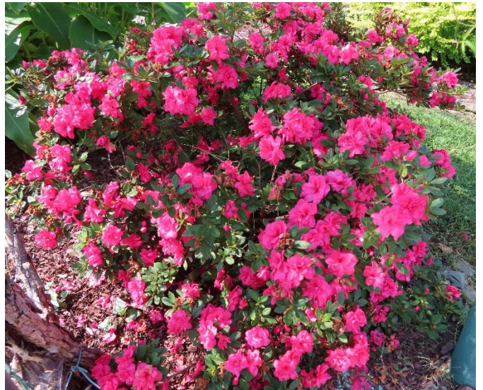
Encore azaleas in bloom by the gate at CC