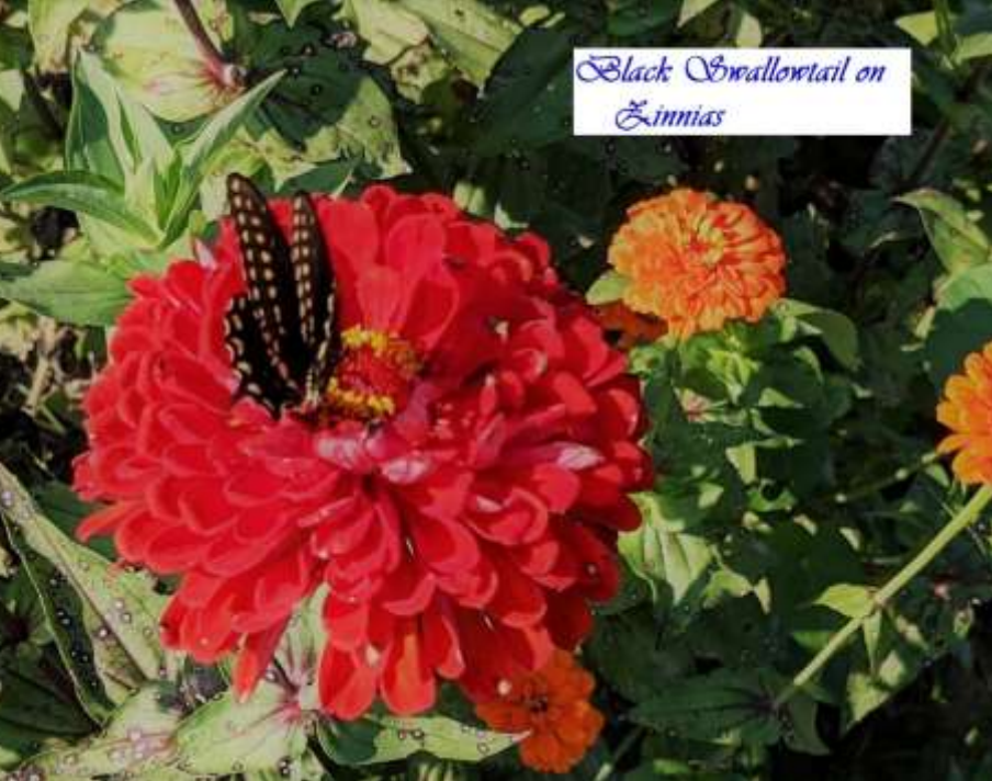
Black Swallowtail on Zinnias