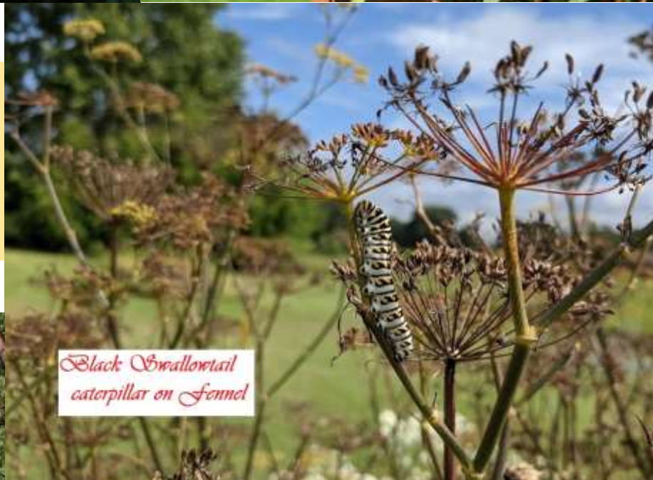
Black Swallowtail caterpillar on Fennel