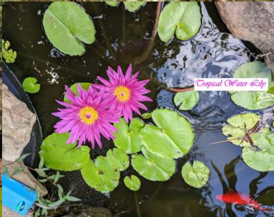
Tropical Water Lily