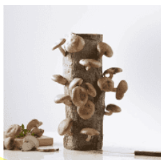
This is the outcome everyone wants