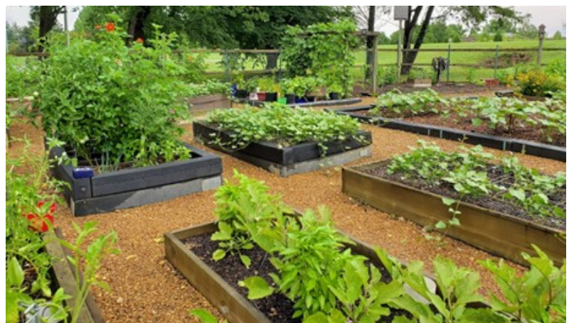
During the growing season, the DVG demonstrated many techniques including the use of pollinator plants, small space gardening, vertical supports, raised beds and wire panels for critter protection.