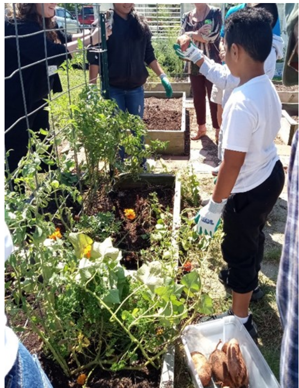
Morris kids harvesting sweet potatoes

Carolyn's contact information: cbwade9@gmail.com