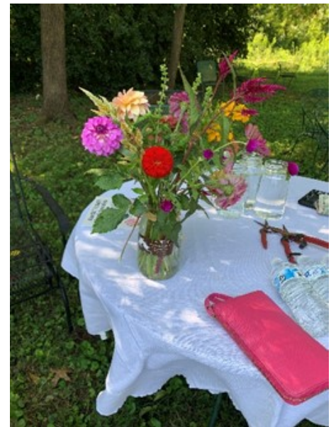
This was one of the floral arrangements made and taken home