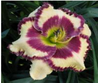
INTRODUCED BY C. DOUGLAS 2015 (h. PUT A RING ON IT)