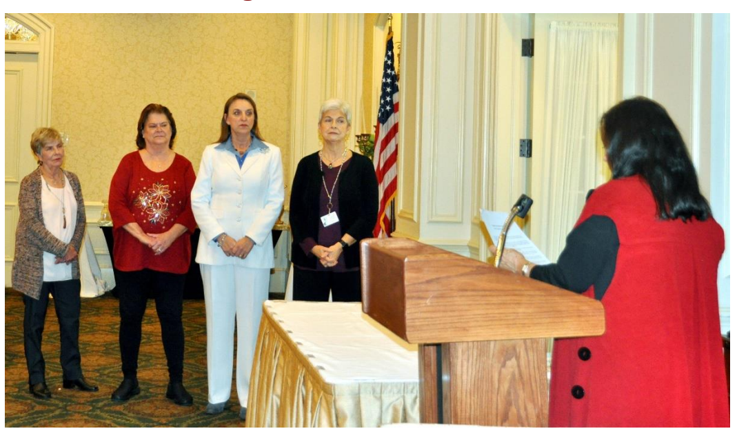
Our President Takes the Gavel