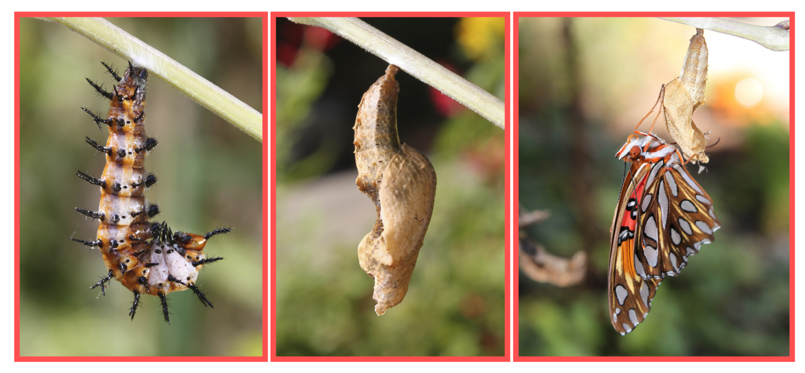
Please consider the environment before printing this e-mail.

I now use this story to convince people to grow native plants in their gardens, because it contains two miracles. Earlier this spring I planted the seeds of the passion vine (Passiflora incarnata), specifically to attract the Gulf fritillary. I figured it would take a year or two before I would start seeing them, but that plant was barely 5 months old before those butterflies showed up to lay their eggs. Even more amazing was the fact that the vines had not even flowered, and they were mixed up with more vigorous hyacinth bean and gourd vines. I had to look hard to see the passion vine in that mix. My friend Michelle Reynolds says, "Plant them and they will come!"