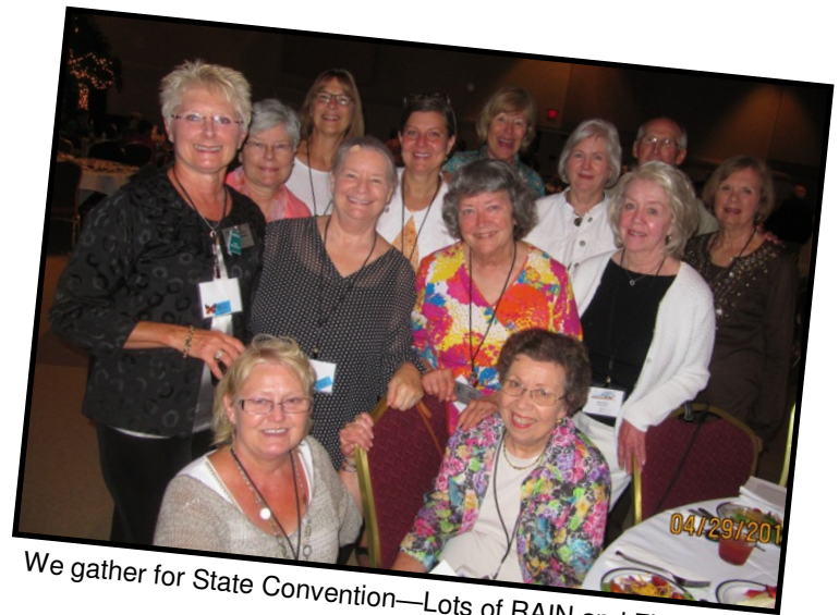
We gather for State Convention—Lots of RAIN and FUN today!