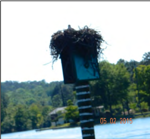
Nesting Osprey on Lay Lake channel marker.