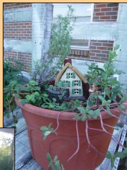
Fairy Garden classes to be offered soon!