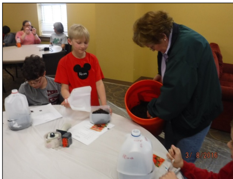
Adding soil—4-H'ers cut open their jugs, added soil and seeds before taping them closed.