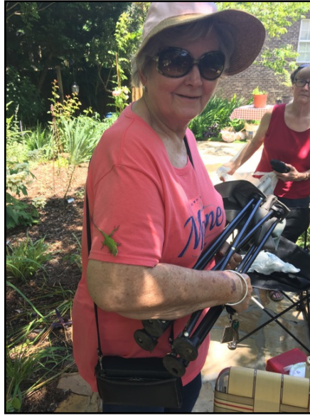
Watch out for little green hitchhikers!