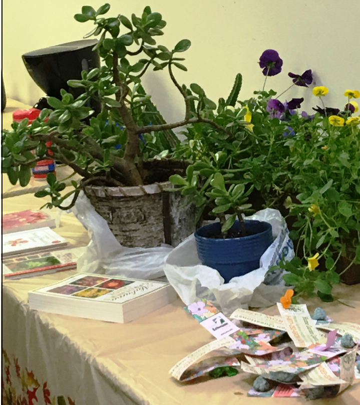
Our November meeting had really nice door prizes!

In 2017, the Oregon State University Extension Master Gardener Program and the Oregon Master Gardener Association will host the 2017 International Master Gardener Conference at the Oregon Convention Center in Portland, OR, July 10-14, 2017, with support from many generous sponsors and friends. Find more info on Facebook or at http://blogs.oregonstate.edu/2017imgc/