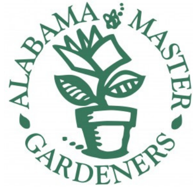
There she is!