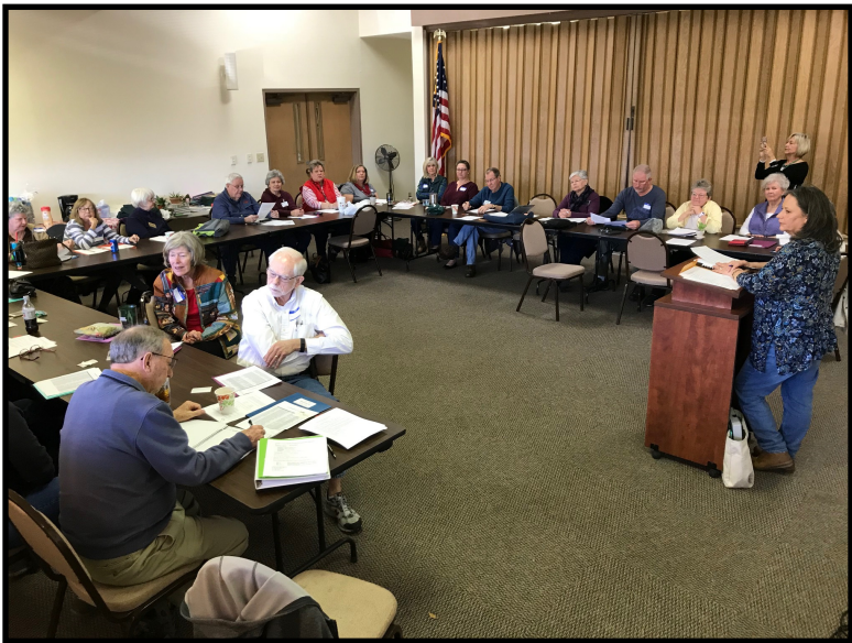
February's meeting had 29 attendees.