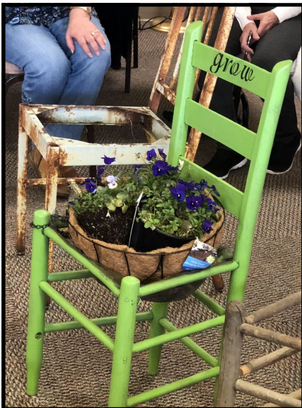
A completed masterpiece by Kate!