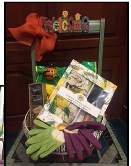
Our completed project and silent auction item for the AMGA State Conference!