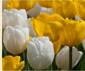
Thanks and Praise