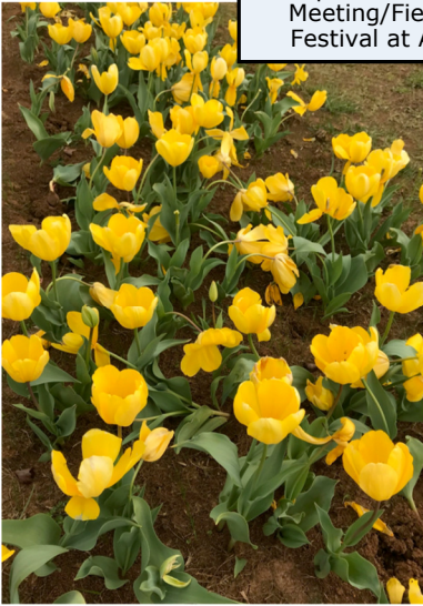
A couple more shots from our March Meeting/Field Trip to the Tulip Festival at American Village...