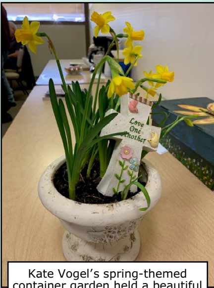
Kate Vogel's spring-themed container garden held a beautiful "Love One Another" message.