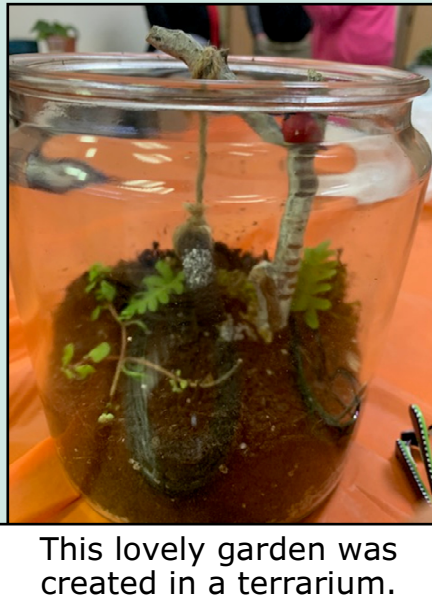
This lovely garden was created in a terrarium.