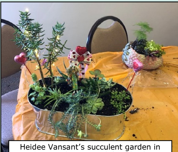
Heidee Vansant's succulent garden in front and Myra Healy's in back