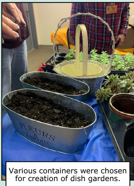
Various containers were chosen for creation of dish gardens.