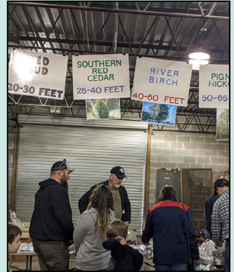
Members of the community line up to select trees.