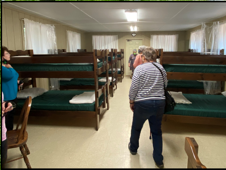
Inside view of one of the cottages.