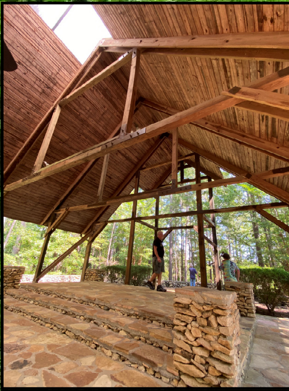
View of the Chapel.