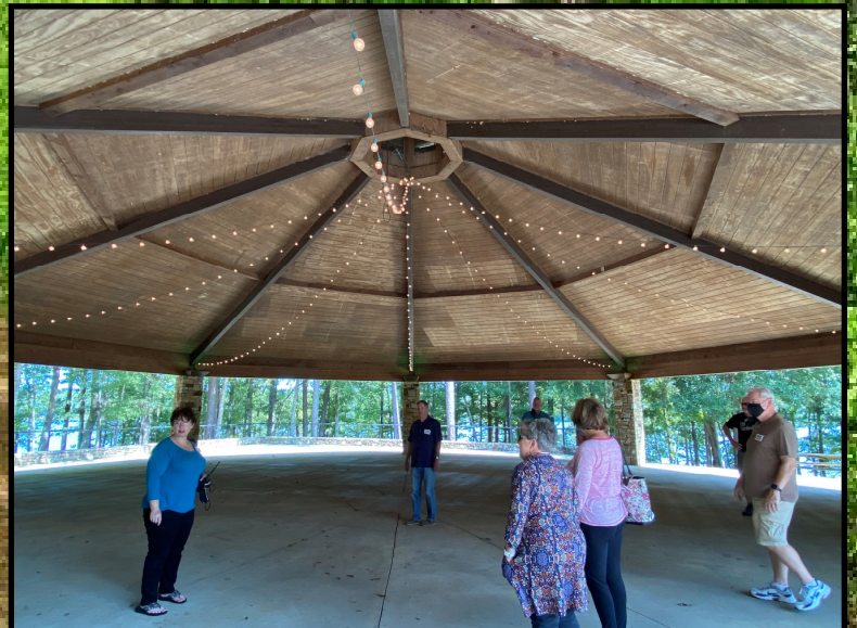
View of the Pavilion.