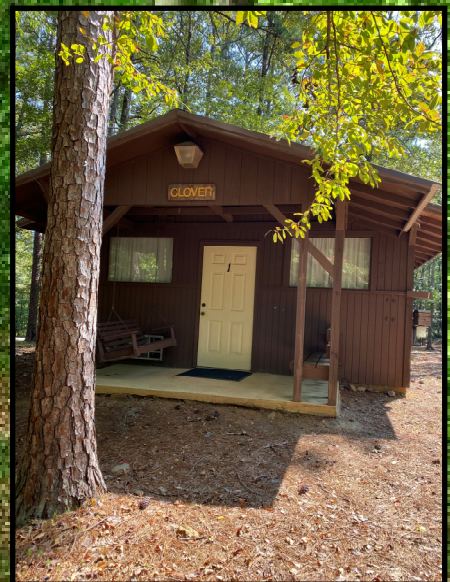
One of the cottages.