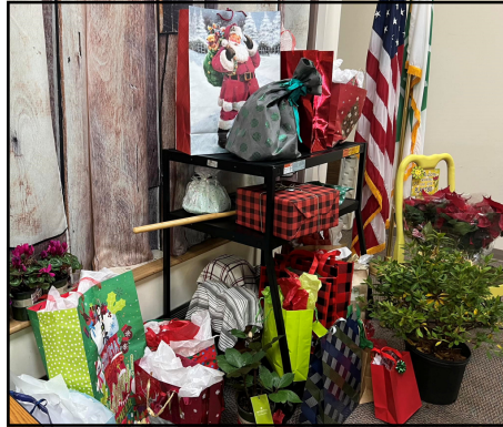
Lots of fabulous gifts!