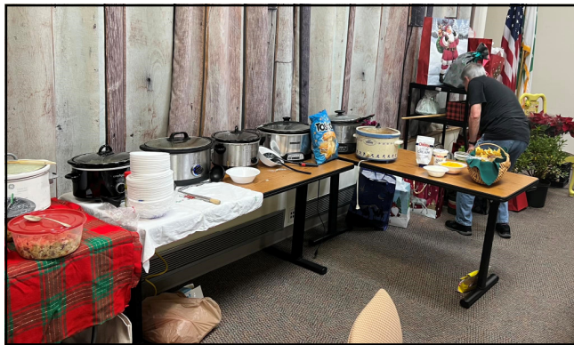
Lots of fabulous food!