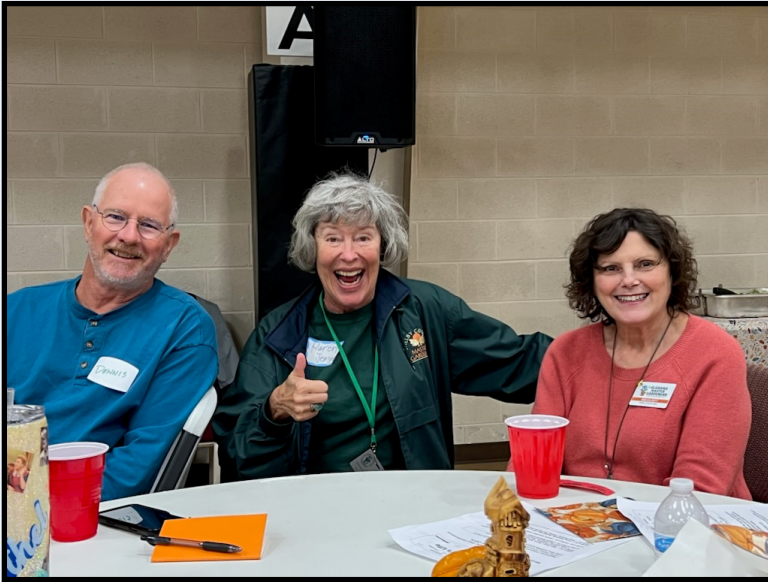
Blount County Conference (carpool) group.