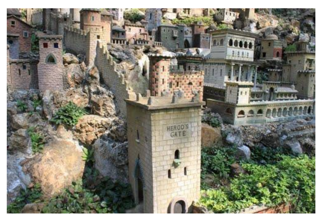
One of the tours being offered at the AMGA conference will be to the Ave Maria Grotto. It is amazing.