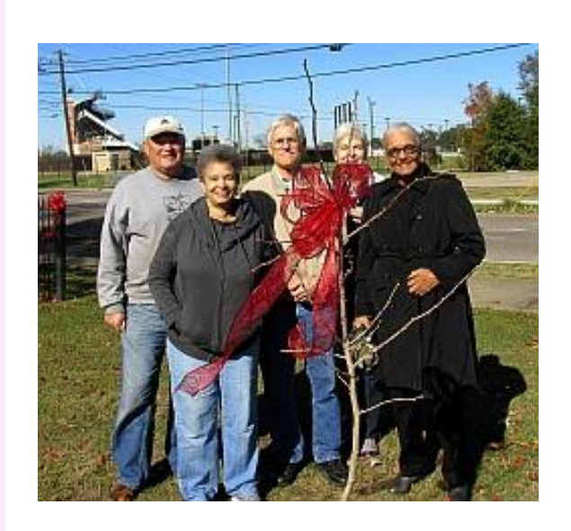
Lilly's Garden Tree Planting & Christmas Decorating