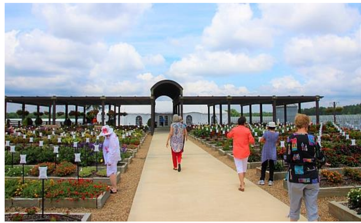
CCMGA Members Gone Wild