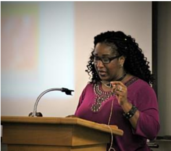
But first a devotional Everyone Needs Someone