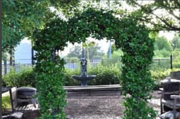
A beautiful trellis.