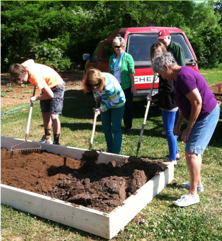
Cherokee County Master Gardeners working with the local community to install and plant raised bed planters.