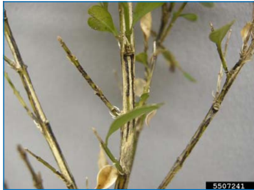
Infected boxwood showing black stem-streaking.

Distinctive symptoms of Boxwood Blight include leaf spots, dropping of leaves, and brown, turning to black stem lesions. It is easily spread by infected leaves transferred to new locations via air, shoes, clothing, or tools. Once infection begins, boxwood blight cannot be effectively controlled. It is recommended that infected plants be burned. See Timely Information, PP-737 at www.aces.edu for more info.