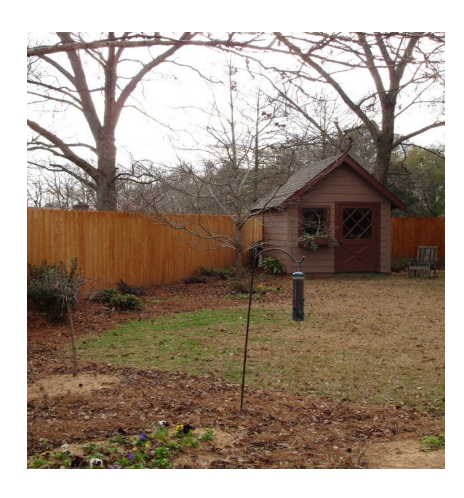
Note the oak tree.