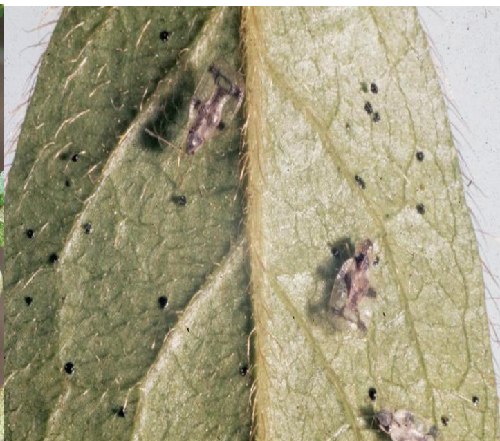
Typical Plant Damage