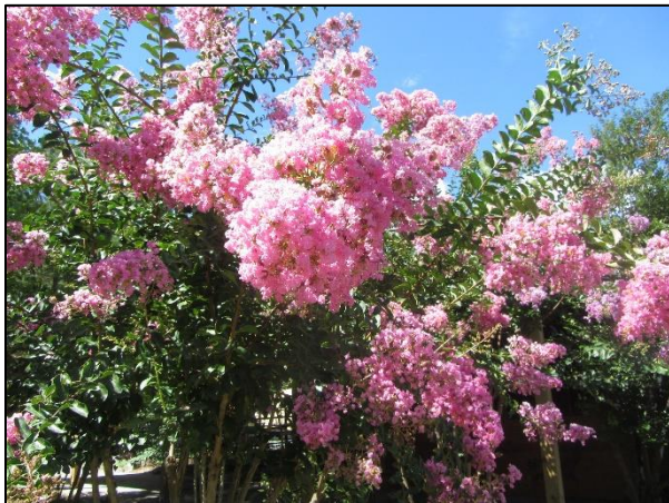
Cane Creek Beauties: Crepe Myrtle