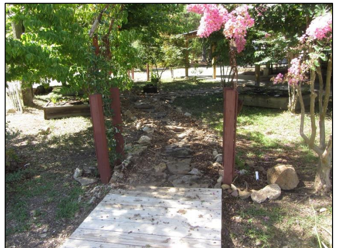
Entrance to Sweet Tea Garden