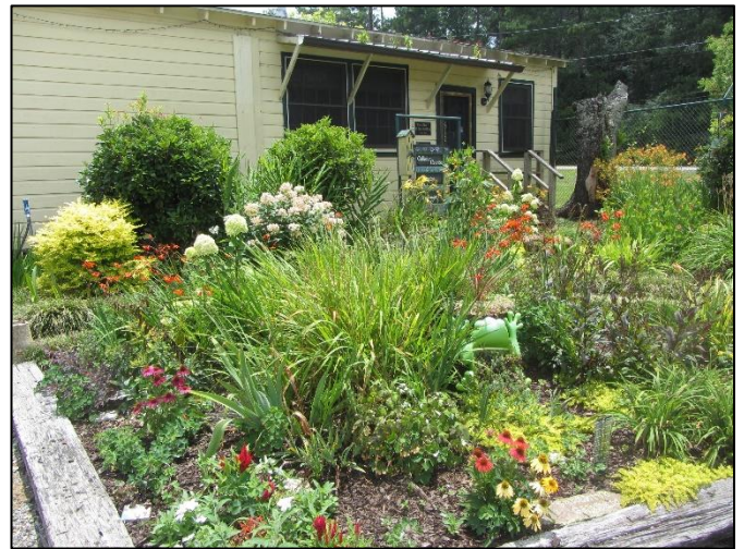
Serenity Garden, Cane Creek Community Gardens

Note: I've made this with fresh figs from Gary Lawson's farm and also adapted the recipe to use fig preserves. Both delicious if you like figs!