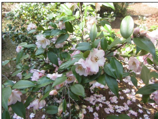
'Tiny Princess' Camellia

An invasive tree is taking over many vacant areas. It is a good time to ID and apply control to invasive Callery Pear seedlings. https://www.uaex.edu/publications/pdf/FSA-6124.pdf