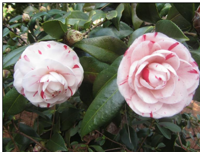
Camellia Japonica 'La Peppermint'