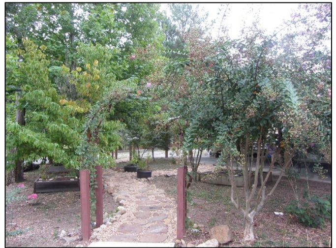
Another view of the Sweet Tea Garden

"Nothing ever looks like it does on the seed packet."