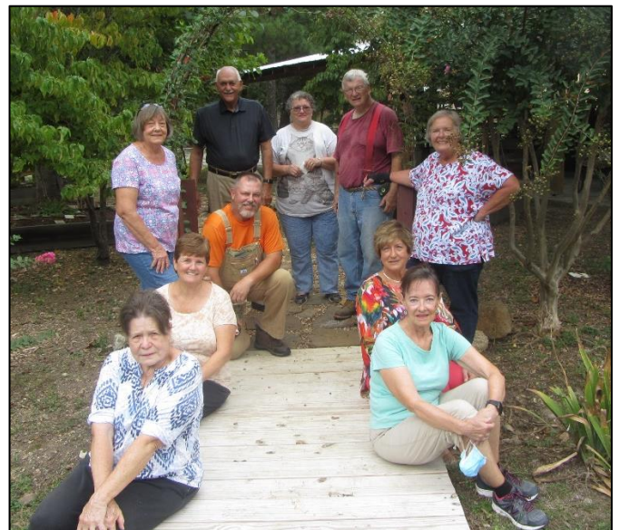
Sweet Tea Garden Volunteers