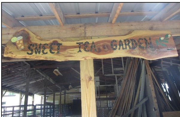
Sweet Tea Garden sign by Myra Gann at Cane Creek Community Gardens