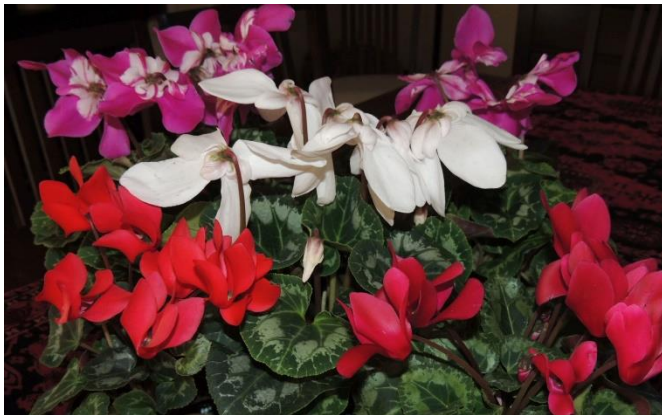
Photo by Doris Baucom. Cyclamen persicum is a "must have" for her garden