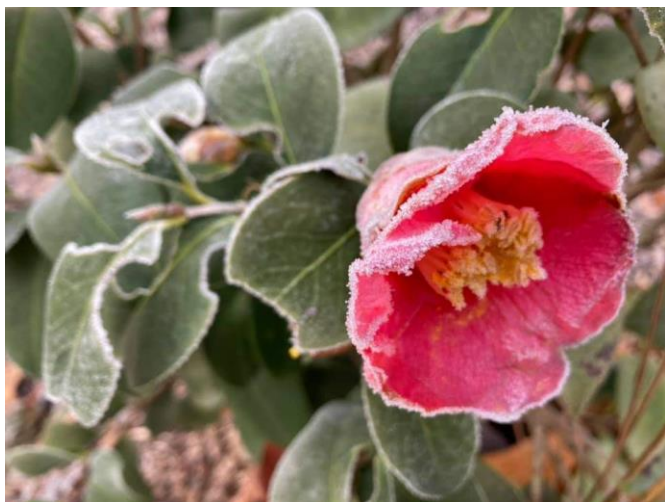
This photo by Hayes Jackson shows camellias brighten a winter garden even on frosty days

It is still a great time to plant; add a least one to your garden. LBG has a wonderful selection of camellias for sale. Contact the Museum to set up an appointment to shop.