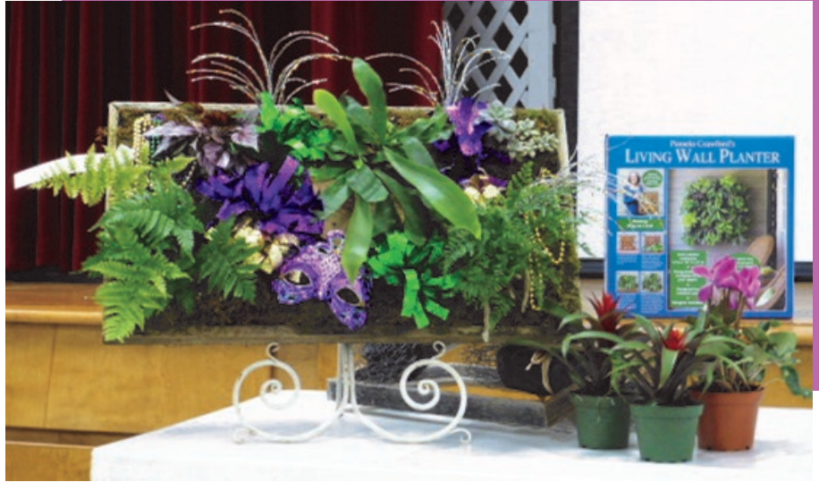
Vertical Garden and supplies