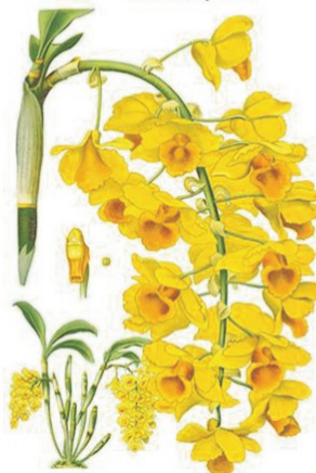
DENDROBIDIUM PALMERI, VAR. AUREOLOPLAVUM

Friday 5 am Exhibit Set up Noon Sales Area Opens 5 pm Show Closes